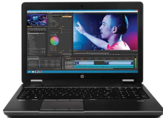
HP ZBook 15 Mobile Workstation

Push your creative limits with a powerful mobile workstation redesigned for productivity on the go.